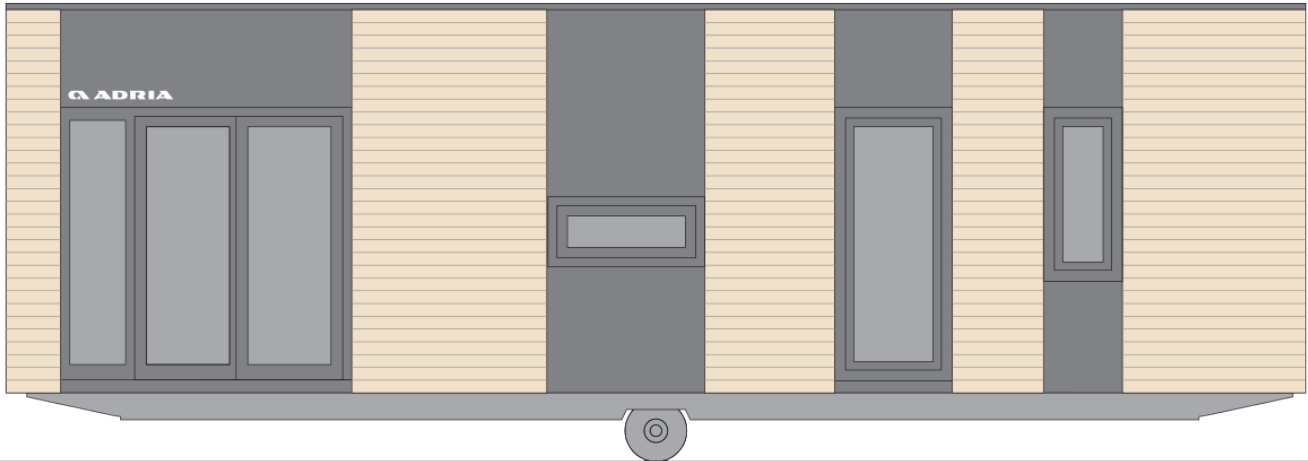
MLine 1004 C21T